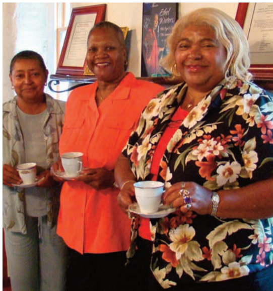
A trip to Hedgerow is a great group event!

Bring your church, club members or employees closer together with an enjoyable outing! Whether you are hosting a fundraiser or simply looking for a fun event to share together, the Hedgerow Theatre, in the words of our audience members, offers “wonderful plays and actors” and great “quality and diversity of shows. There’s something for everyone’s tastes.”