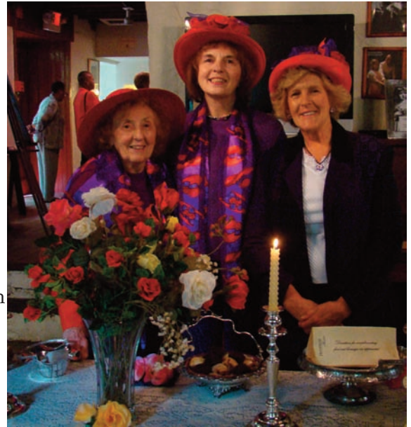
Enjoy our Wednesday shows and teas!

With select 1 p.m. Wednesday Afternoon Complimentary Tea Party Intermission Shows; select performances on Saturdays at 4 p.m. and 2 p.m. Sunday matinees in addition to our regular evening shows, we can fit your schedule! We also offer easy access and wheelchair seating. Complimentary intermission refreshments include coffee, tea, and iced tea and snacks. Free on-site parking for buses. Complimentary tickets to the escort and driver are included.